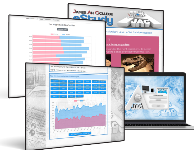
- Year 4 Opportunity Class trial test online revision and test report -

Students will receive a computerised test report the following week that gives a close indication of the child's performance which can be tracked via our online portal.